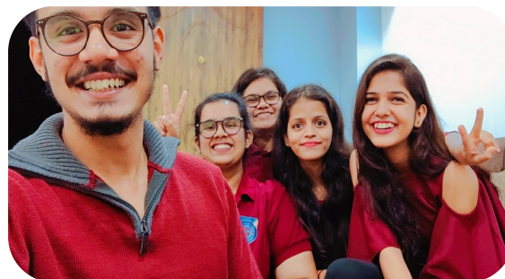
Organising Team of ECO VISION 2020